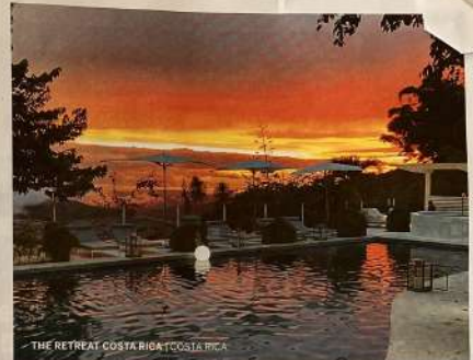
THE RETREAT COSTA RICA | COSTA RICA

A most appropriate host for Synergy, Palmaia The House of AIA is surrounded by more than half a mile of beautiful beach on the Riviera Maya. You don’t drive in; you’re brought by motor cart through an adjacent Cancun-style resort and enter the sanctuary through a tunnel of greenery. Inside, there is water everywhere: cenotes, pools, the ocean. A ground floor suite has a grand soaking tub in the main space, and a couple steps beyond the sliding glass doors puts you into a swimming pool. The suite has a separate bunkroom for kids or grandkids, who would obviously have