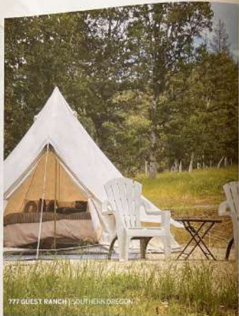
777 GUEST RANCH | SOUTHERN OREGON