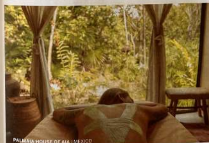
PALMAIA HOUSE OF AIA | MEXICO